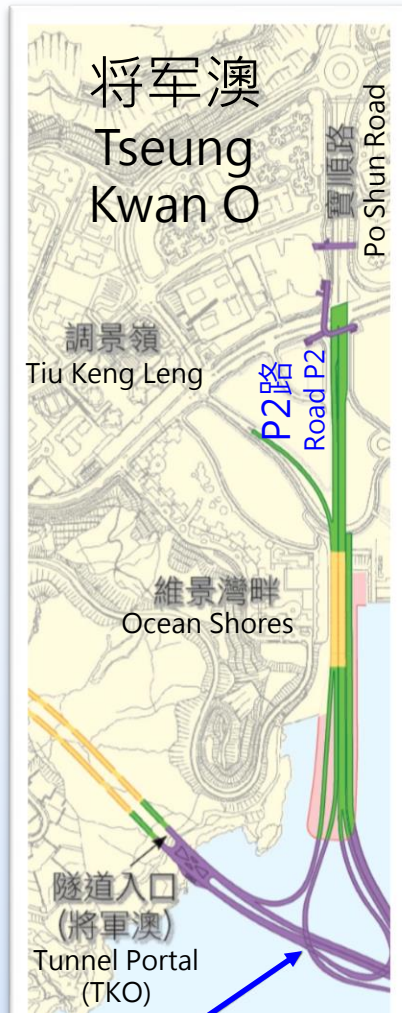
将军澳交汇处 Tseung Kwan O Interchange